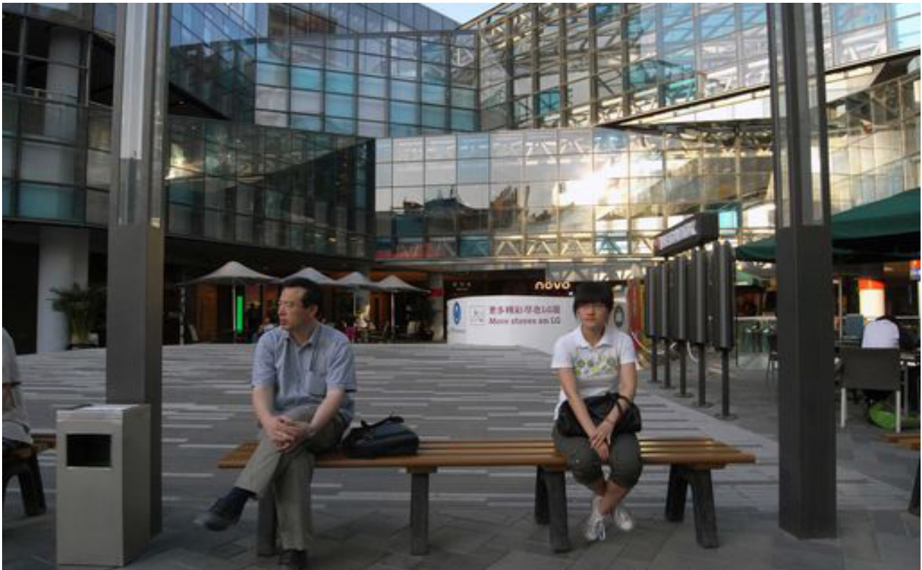
Customers take a rest in the main plaza of Beijing SOHO mall.