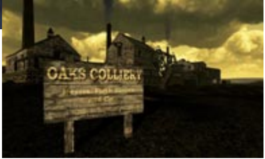
Images: Makeshift studio Approach to the Oaks