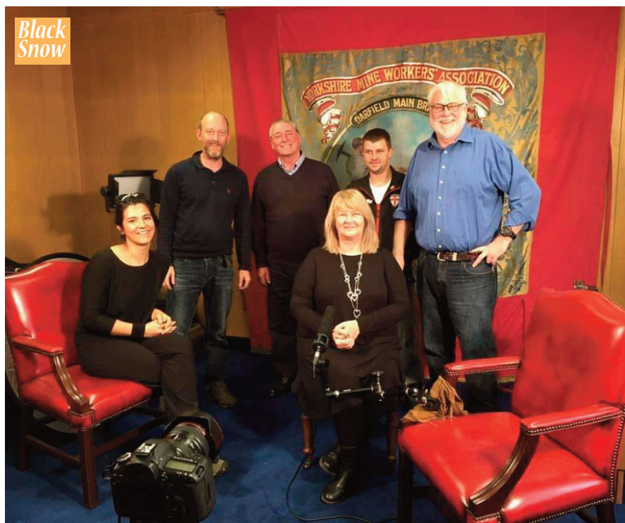
Images: Makeshift studio Approach to the Oaks